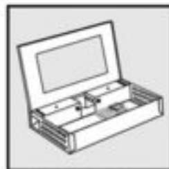
In 611 Dual Action Twin Catch